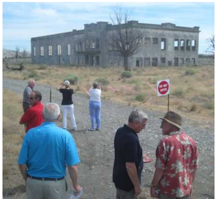
Columbia High School (Richland) Class of 1959 members and spouses stop at Hanford High School on their way to the B Reactor tour this past summer

Apparently, they were so excited by the Reactor (where tons of pictures were taken) that they didn’t think to include anybody in their shots.