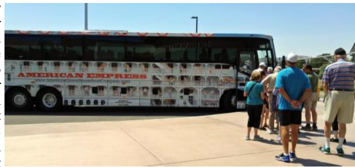
Tour bus at The Reach

Of note on the tour were a couple from Oak Ridge, Tennessee. Yes, that Oak Ridge, one-third of the new Manhattan Project National Historical Park. Turns out the