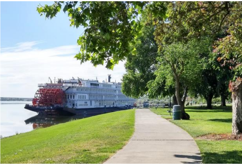
The American Empress tour boat docked at Howard Amon Park