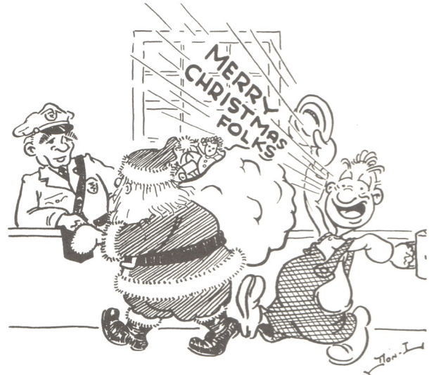
O.K. MR. CLAUS — NOW LETS SEE WOTCHA GOT IN THE BAG —