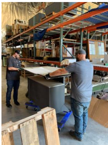
Picture 1. Teamsters loading artifacts.