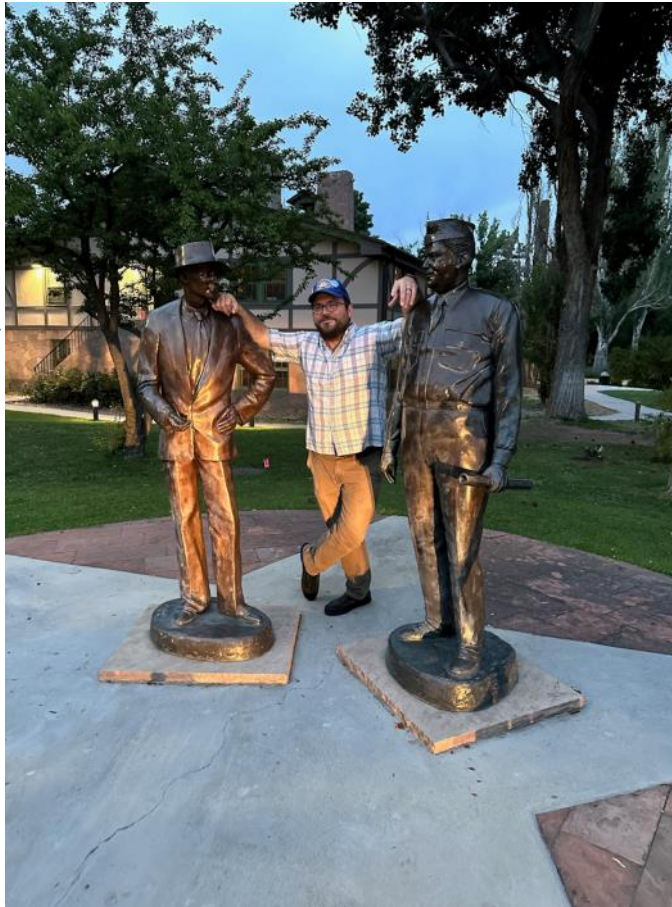
Our Prez hangin’ out with some MP notables